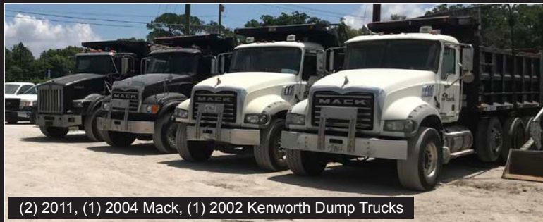
(2) 2011, (1) 2004 Mack, (1) 2002 Kenworth Dump Trucks