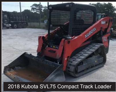
2018 Kubota SVL75 Compact Track Loader