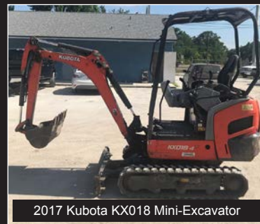
2017 Kubota KX018 Mini-Excavator