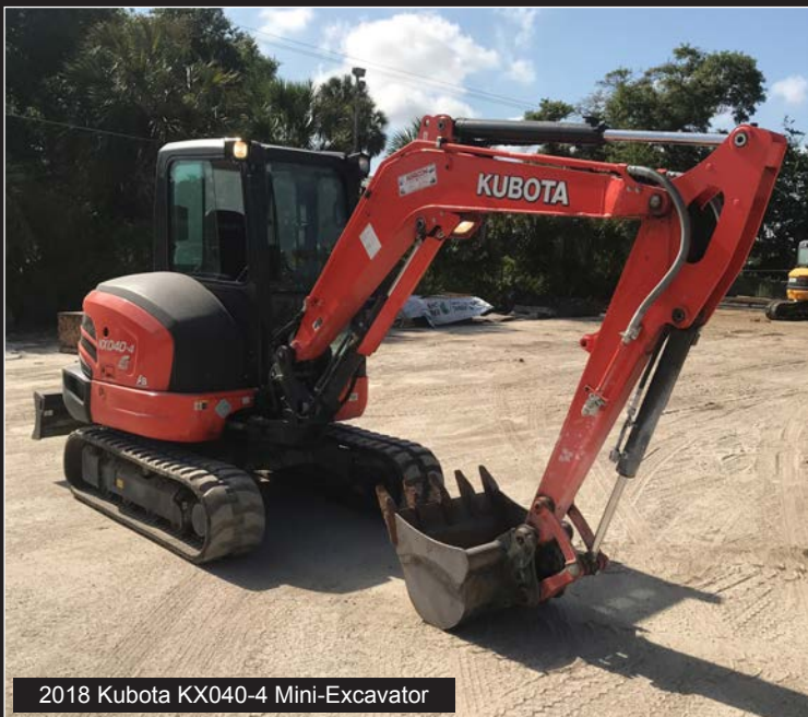
2018 Kubota KX040-4 Mini-Excavator

LOCATION: 2713 Country Club Road, Sanford, FL 32771