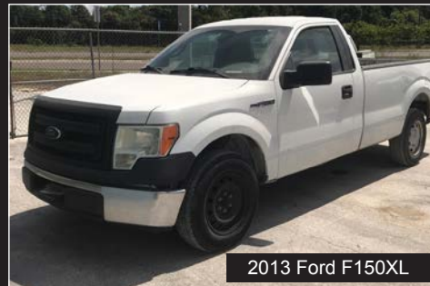
2013 Ford F150XL

EVERYTHING SELLS TO THE HIGHEST BIDDER, REGARDLESS OF PRICE!